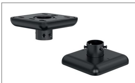
Neat ceiling and floor finish