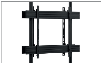
Height adjustable along the poles (Tool needed)