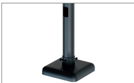
Internal cable routing